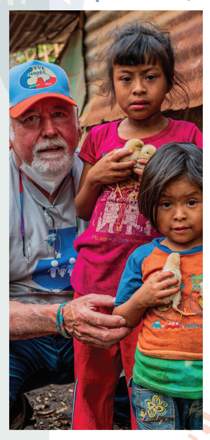
2019 Mission #100 is celebrated!

937 surgeries performed 14 medical missions